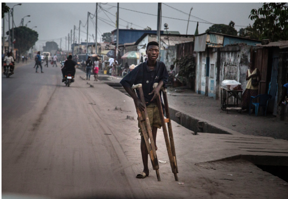
Making transportation and road infrastructure safe and accessible is essential for persons with disabilities to access a safe mobility.

Working on a safe transportation system benefits all users and the society as a whole.